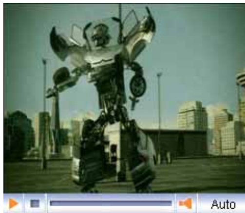
Clipstream™ Video features high quality instant play video with a variety of play options